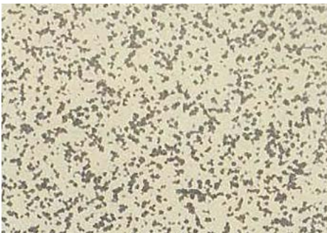
SICODUR™ GREY PORPHYRY