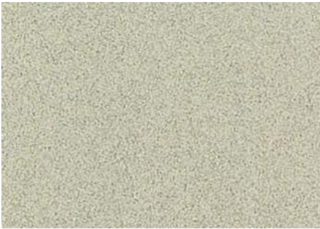
SICODUR™ GREY SPECKLE