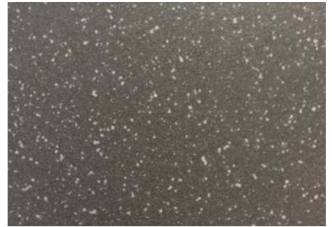
SICODUR™ ANTHRACITE MIX