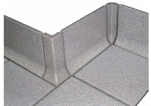
COVES, INTERNAL & EXTERNAL PILLARS

Coves available for all tiles. Internal and external pillars available for all Sicodur colours. Cove tiles are produced in smooth finish.