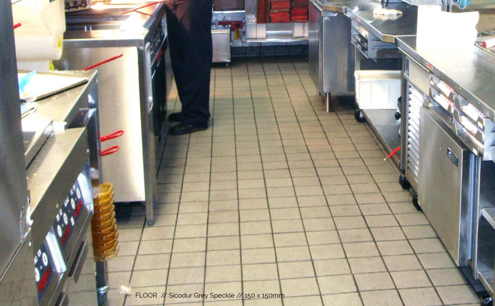
FLOOR // Sicodur Grey Speckle // 150 x 150mm

A busy commercial kitchen is one of the most demanding work environments. Many people in relatively small hot areas working with and around oily spillages, sharp equipment, flames, hot surfaces, boiling liquids and moving heavy items - all while under time pressures. This environment needs a floor that will perform in providing long term safety, hygiene and durability.