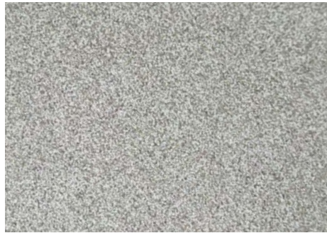
SICODUR™ GRAPHITE MIX