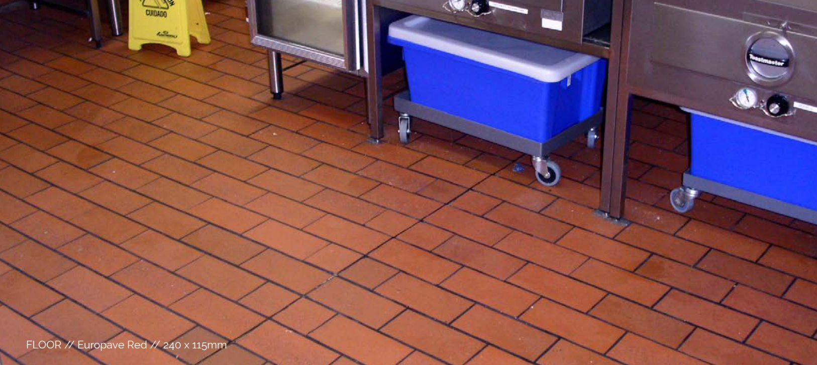
FLOOR // Europave Red // 240 x 115mm